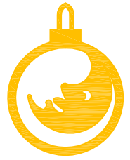
Finished cutting Christmas-Pattern-010